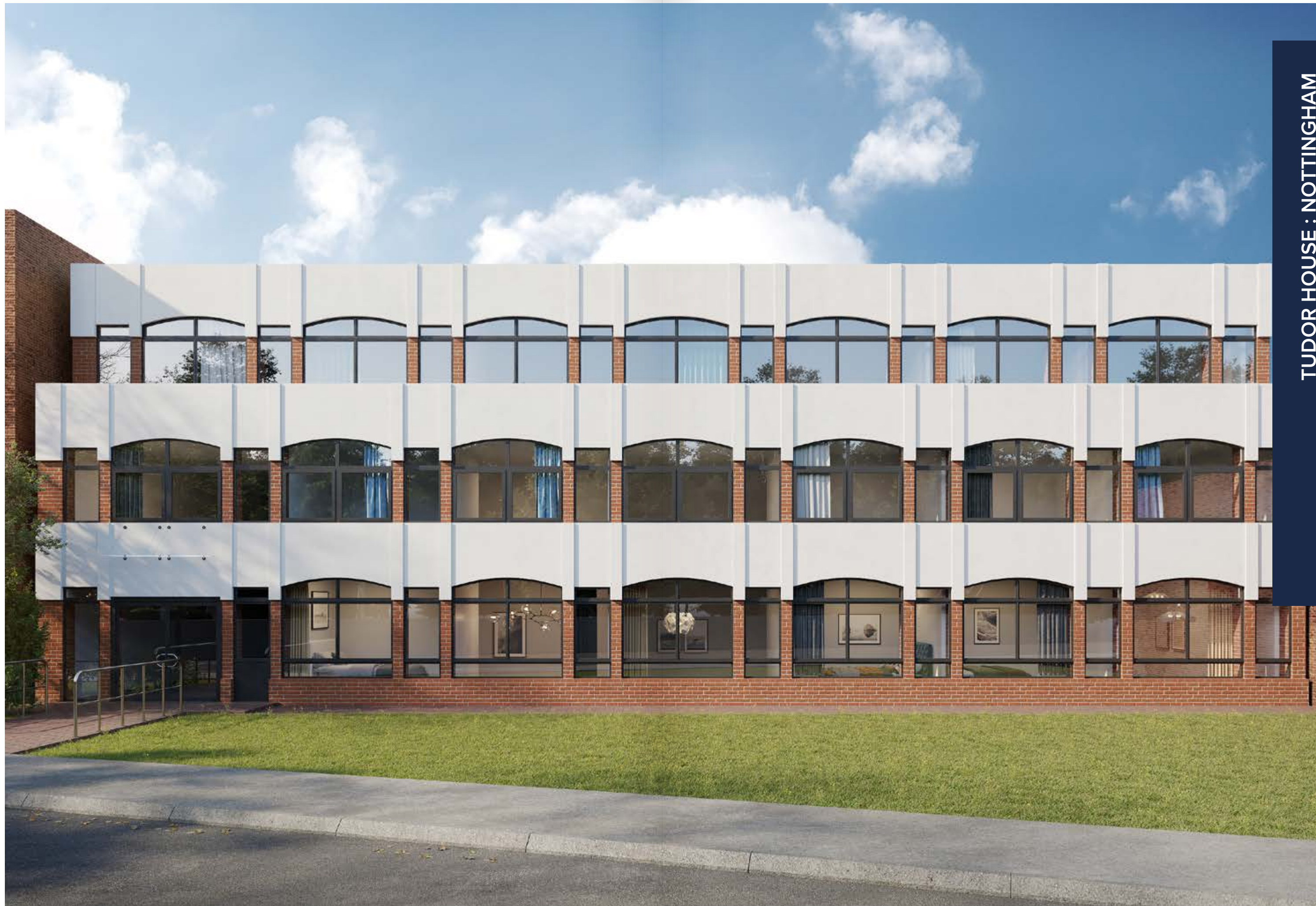
TUDOR HOUSE : NOTTINGHAM